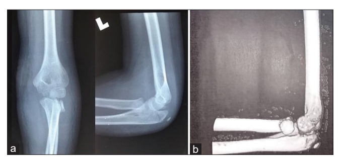
Figure 1: (a) Preoperative anteroposterior and lateral radiograph of the left elbow showing completely displaced radial neck fracture. (b) Preoperative computed tomography scan of the left elbow showing the position of the displaced radial head.

The first case was a 12-year-old boy who attended the emergency room with a history of a fall and sustaining trauma to the left elbow 10 days before the presentation. Examination revealed swelling of the elbow and forearm without any neurovascular injury. A radiograph and a computerized tomography showed a completely displaced fractured radial neck and an un-displaced fractured olecranon process [Figure 1]. We used a size 2.5 mm