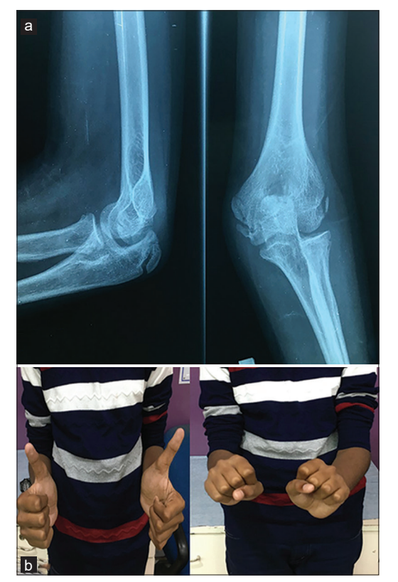
Figure 3: (a) Radiograph anteroposterior and lateral at 1-year follow-up showing anatomical position of the radial head. (b) Clinical photograph showing the full range of motion with the normal function of the radial nerve like the uninjured side.

The management of completely displaced radial neck fractures in children is often demanding and needs an