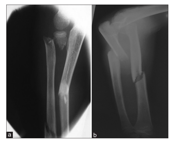
Figure 4: (a and b) AP and lateral radiograph of the forearm showing completely displaced fracture radial neck with ipsilateral fracture shaft of ulna and radius.

The incision was made laterally proximal to the growth plate and protecting the superficial branch of the radial nerve. The K-wire was gradually passed into the shaft by a