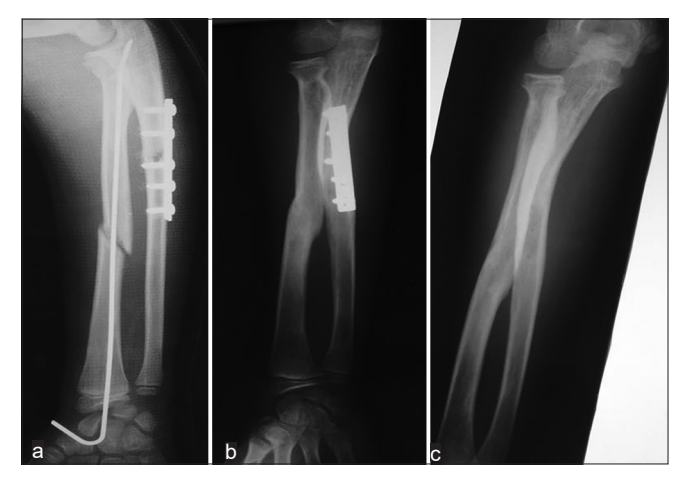
Figure 5: (a) Postoperative radiograph showing fixation of all fractures. (b) Eight weeks postoperative following removal of the K-wire. (c) Six months postoperative following removal of the plate showing sound union of all fractures, with well-located radial head.