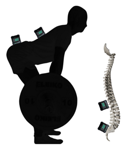
1: Digital inclinometer measurement technique example.

It was positioned over the S1/S2 and T12/L1 for all measurements [Figure 2]. On day 1 (no warm-up), an unloaded neutral (UN) position was measured at -16° while the participant was standing. Max flexion (MF) was then measured at 26° as the participant was asked to touch his toes. The total flexion range of motion (TFROM) in