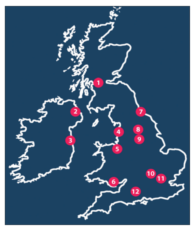
Figure 1: The United Kingdom spinal cord injury centers. (1) Glasgow (Queen Elizabeth National Spinal Injuries Unit). (2) Belfast (Musgrave Park Hospital). (3) Dublin, EIRE (National Medical Rehabilitation Centre). (4) Southport (Northwest Regional Spinal Injuries Centre). (5) Oswestry (Midlands Centre for Spinal Injuries). (6) Cardiff (Welsh Spinal Injuries and Neurological Rehabilitation Centre). (7) Middlesbrough (Golden Jubilee Regional Spinal Cord Injury Centre). (8) Wakefield (New Pinderfields Regional Spinal Injuries Centre). (9) Sheffield (Princess Royal Spinal Injuries Centre). (10) Aylesbury (The National Spinal Injuries Centre). (11) Stanmore (Spinal Cord Injuries Centre). (12) Salisbury (Duke of Cornwall Spinal Treatment Centre).

A postal questionnaire was distributed to the clinical lead of each UK and EIRE SCIC [Figure 1] in early 2015. Respondents were asked to detail the number of new traumatic SCI patients