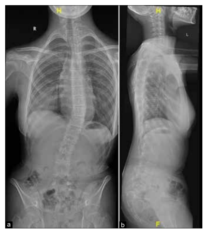
Figure 2: (a) Pre-operative full spine radiograph shows coronal malalignment. (b) Pre-operative full spine radiograph with retroverted pelvis.

Before starting the incision, the baseline neuromonitoring showed no anal muscle response bilaterally, and while removing the implants a sudden return of the anal muscle response in the neuromonitoring was observed. Resection of the sacral dome and complete removal of intervertebral disc were performed. Polyetheretherketone intervertebral cage was inserted after the preparation of the S1 endplate.