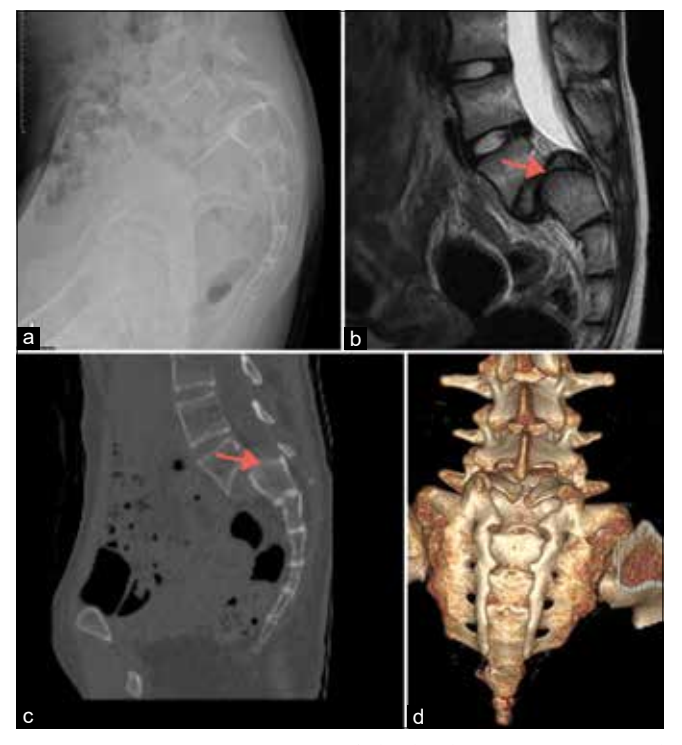
Figure 1: Pre-operative images of the lumbar spine. (a) Lateral radiograph view shows dysplastic type of L5-S1 spondylolisthesis with unbalanced pelvis. (b) Sagittal view magnetic resonance imaging shows a large L5-S1 intervertebral disc (arrow). (c) Sagittal view computed tomography scan shows the sacral dome (arrow). (d) 3D reconstruction of lumbosacral junction shows a complete agenesis of dorsal wall of sacral canal.

She underwent a posterior approach, L5 laminectomy, and L5-S1 instrumentation with posterolateral fusion. Only, a