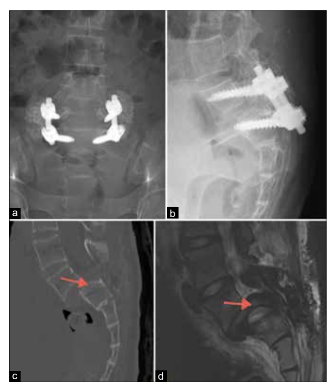
Figure 3: Immediate post-operative images. (a and b) Anteroposterior and lateral views radiograph show L5-S1 instrumentation with posterolateral bone graft. (c) Sagittal view computed tomography scan shows partially resected sacral dome (arrow). (d) Sagittal view magnetic resonance imaging shows partially resected L5-S1 intervertebral disc (arrow).

The pedicular screws in L5 and S1 were changed with larger diameter screws. New L4 pedicular and iliac screws were added bilaterally and almost 25% reduction was achieved with normal neuromonitoring till the end of surgery [Figures 4 and 5].