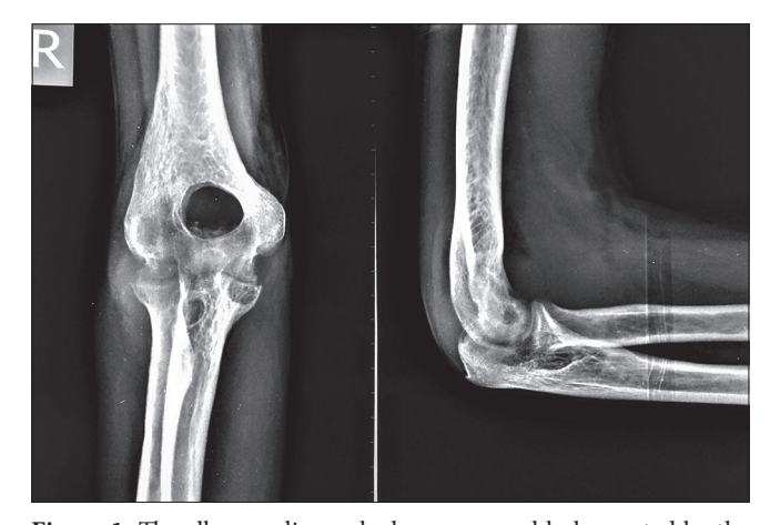
Figure 1: The elbow radiograph shows a round hole created by the enlarged coronoid (or olecranon) fossa by the disease process, along with a poorly defined joint outline and regional osteopenia. Two eccentric lytic lesions are appreciated in the proximal ulna, and a hazy olecranon tip can be seen within the round hole.

How to cite this article: Dharmshaktu GS, Pangtey T. A big round hole in the elbow. J Musculoskelet Surg Res 2023;7:67-9.