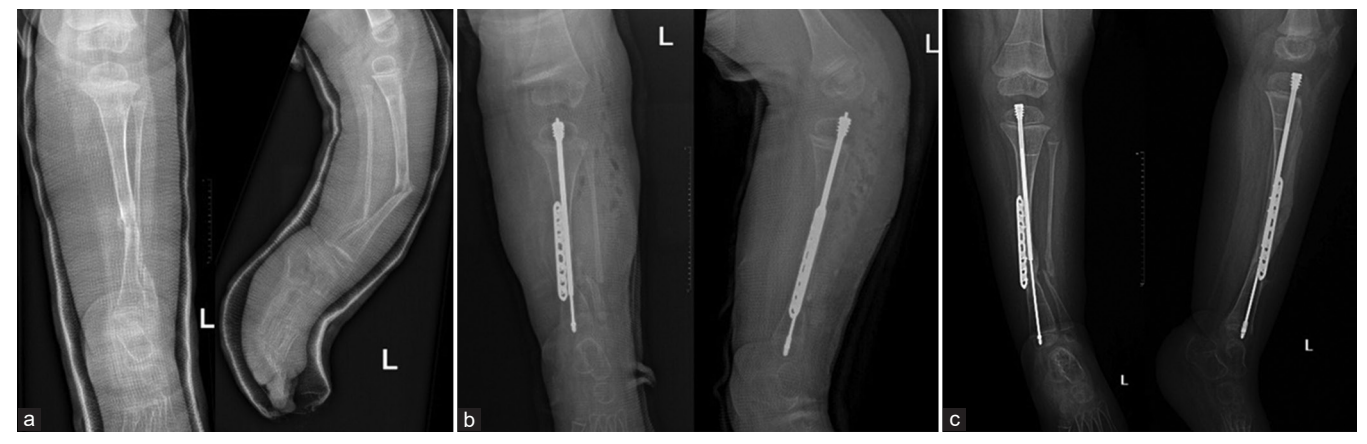
Figure 2: Radiological images of a patient with congenital pseudoarthrosis of the tibia who was treated with Fassier-Duval nail and tibial plating. (a) shows a pre-operative radiograph, (b) was taken 1 day postoperatively, and (c) shows complete union after 4 months from surgery.

external fixation using the Ilizarov frame. In a study by Akaro et al.,[5] intramedullary rodding or circular external fixation using the Ilizarov frame was used in 54.7% and 18.8% of cases, respectively. Of 54.7% who underwent intramedullary rodding, approximately 8.3% had a solid tibial union that used no external support or splint. In another study, the