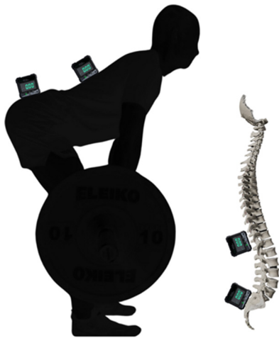
Figure 1: Digital inclinometer measurement technique example.