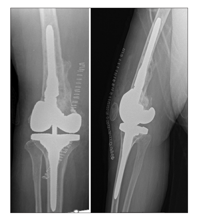
Figure 3: Immediate postoperative anteroposterior and lateral radiographs of the right knee.

She was seen on regular follow-up for 4 years, with good functional improvement. She could walk with a cane and