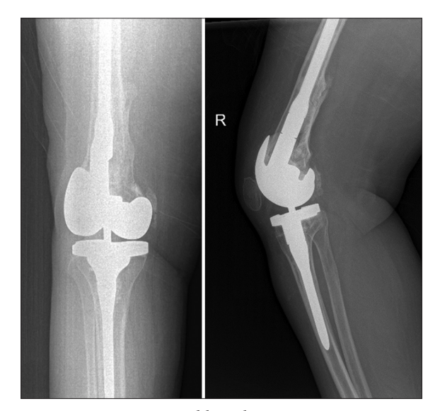
Figure 4: Anteroposterior and lateral view at 3 years postoperative showing proper alignment with no signs of loosening.

Lower limb deformities, patella Baja, are common sequelae of poliomyelitis. At the same time, our patient has an additional deformity, a malunited distal femur fracture with a very stiff knee and moderate osteoporosis, making the exposure very difficult. However, we managed to proceed through the surgery without using additional exposure techniques. In