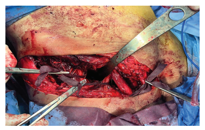
Figure 4: The middle window between the ileo-psoas muscle, with the femoral nerve laterally and the external iliac vessels medially.