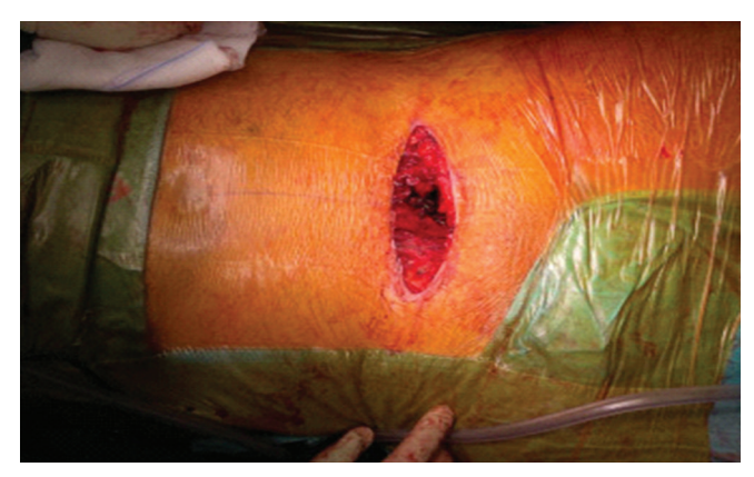
Figure 6: The modified Stoppa approach.

An orthopedic surgeon has evaluated the quality of reduction using Hammad<sup>[7]</sup> criteria while remaining blind to the procedure. These results were calculated after one year of follow-up. These measures evaluate the reduction in the residual displacement of the analyzed fragments: