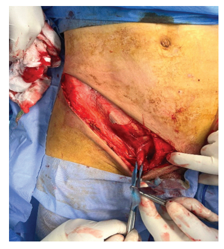
Figure 5: The spermatic cord identification.

nerve to obtain a wide visualization of the quadrilateral plate. The corona mortis, which is situated 5–7 cm lateral to the pubic symphysis, must be promptly identified and ligated or cauterized. This is the most crucial phase in the surgery. This access does not allow the exposure of posterior column fractures. However, indirect reduction and fixation of posterior wall fracture can be obtained through this approach [Figure 6].