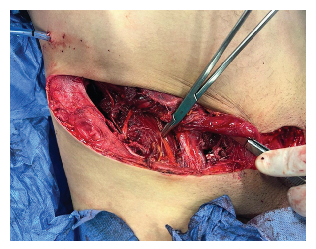
Figure 3: The ileo-psoas muscle with the femoral nerve.

The pubic bones are accessible through the medial window, which develops between the external iliac arteries and the spermatic cord. In addition, it aids in plate medial side