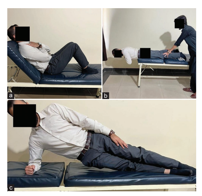
Figure 2: McGill's torso muscular endurance test. (a) The trunk flexor endurance test, (b) the extensor endurance test, and (c) the lateral flexor endurance test.