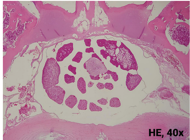
Figure 1: Axial view of normal lumbar vertebrae. HE: Hematoxylin and eosin.

This study demonstrated that rats receiving autologous fat pads in the laminectomy defect area showed histological