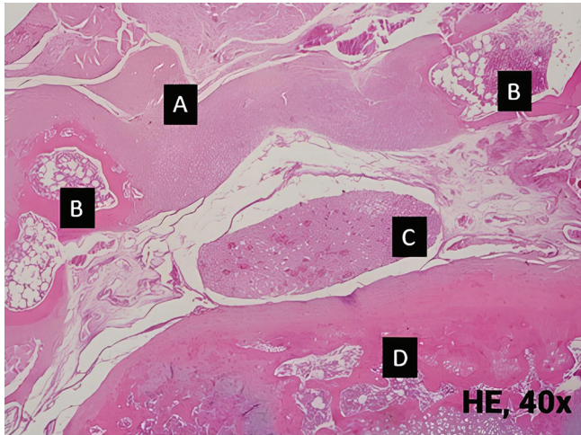
Figure 3: Histopathological view of grade I epidural fibrosis on Autologous fat group. Only slight fibrous tissue is observed. (A): Epidural fibrosis, (B): Bone, (C): Cauda equina, (D): Vertebral body. HE: Hematoxylin and eosin.