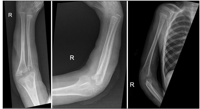
Figure 4: Four-month postoperative radiographs