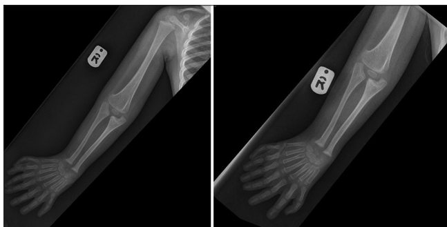
Figure 1: Preoperative anteroposterior upper limb radiographs showing duplication of the ulna with seven metacarpal bones and seven digits

Posterolateral longitudinal incision at the elbow was done. Dissection of the abnormal lateral epicondyle was performed. Triceps was found split into two halves, one half to the preaxial ulna and the other one to the postaxial. A lateral tunnel was noted, which contained what looked like a duplicate ulnar nerve on the lateral aspect. Medially, normal anatomy of the ulnar nerve, larger in size, twice as large as the lateral one was noted. The joint was opened posteriorly, and the range of motion improved after that by 5°–10° of flexion only, reaching 10°–20°. Posterior release of the capsule was done, the lateral collateral ligament was resected, while the medial collateral ligament was preserved, and this allowed more flexion. Anterior release of the capsule was done proximally and helped us to gain another 40° of flexion. By resection of the proximal ulna on the lateral (preaxial) side, at the level of the coronoid process, we