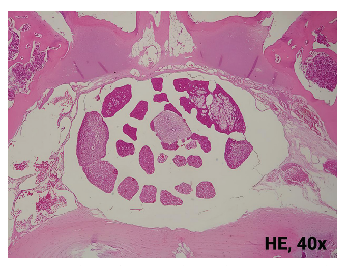
Figure 1: Axial view of normal lumbar vertebrae. HE: Hematoxylin

This study demonstrated that rats receiving autologous fat pads in the laminectomy defect area showed histological