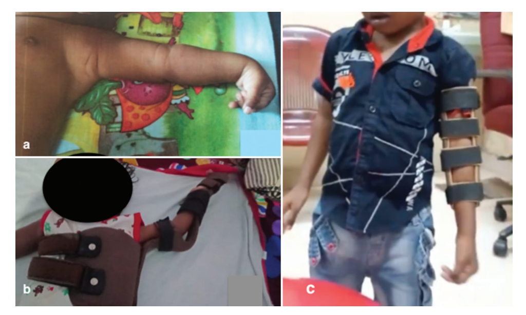
Figure 1: Sequential images illustrating the patient's progression from birth to the present condition: (a) Depicts the left shoulder in abduction, with the elbow extended, forearm pronated, and wrist and fingers flexed and ulnar deviated, creating a "policeman's tip" posture. (b) Shows the application of an abduction and external rotation brace, which was introduced at 3 months of age. (c) Highlights the use of an elbow extension splint, implemented to improve the patient's left shoulder and upper limb function.

Imaging studies may reveal abnormal muscle development due to disrupted neural input during the neonatal period. Muscle biopsy studies of the rotator cuff in patients with BPBP