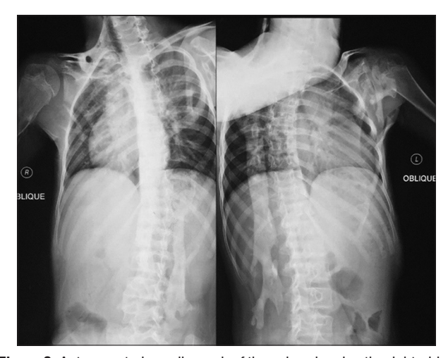
Figure 3: Anteroposterior radiograph of the spine showing the right-sided radiopaque band extending from the cervical to the lumbar spine, and also showing dextrocardia

malformed hypoplastic bilateral big toes [Figure 2], which was present since birth. Furthermore, a grossly deformed back with a hard, irregular, well-formed, painless mass extending from the right shoulder posteriorly down to the right pelvic area, along