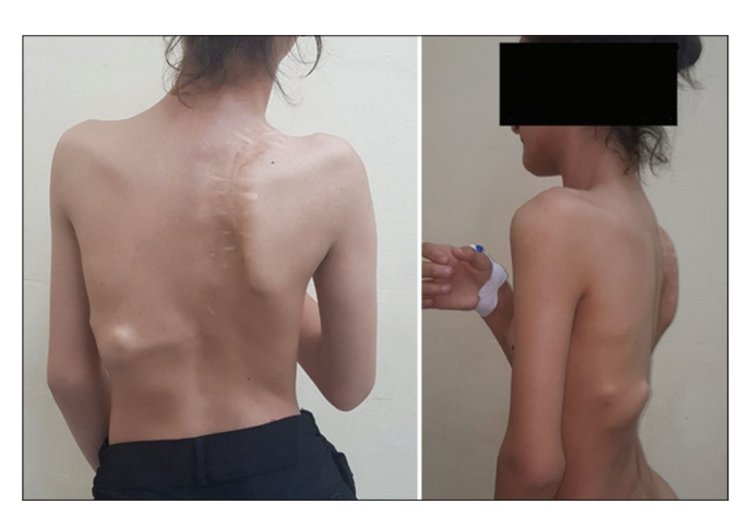
Figure 1: Multiple hard irregular masses in the deformed back

She has continued her schooling and has done well, leading a relatively normal life with deformity and occasional pain. She did not complain of respiratory problems, has no conductive hearing defects, no retinopathy, and no childhood glaucoma. She had normal teeth development and did not start menstruating. She has three normal younger brothers, and there was no family history for the same condition. On examination, we noticed