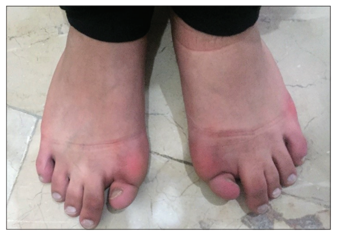
Figure 2: Malformed hypoplastic bilateral big toes

malformed hypoplastic bilateral big toes [Figure 2], which was present since birth. Furthermore, a grossly deformed back with a hard, irregular, well-formed, painless mass extending from the right shoulder posteriorly down to the right pelvic area, along