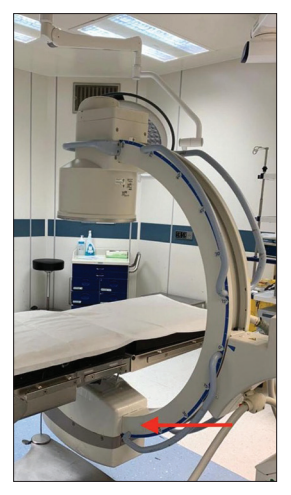
Figure 2: The preferable setup with the X-ray tube (arrow) on the bottom

Since the radiation protection principle of ICRP is to lower ionizing radiation exposure time, establishing a mutual connection with the operator will lower the time and limits its danger.<sup>[6,7,10]</sup> In the present study, only 57.3% of the surgeons utilized a radiology technician's assistant. In the case that an unqualified operator is sought, the risk will increase significantly.