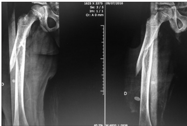
Figure 1: A 10-year-old male, struck by a car

Kelly et al. reported complications associated with plate retention in three patients who were lost to follow-up after consolidation. [31] Distal molding of the plate was used in all three cases to adapt the plate to the distal femoral metaphysis. The patients were readmitted at 3, 4, and 7 years after surgery and showed proximal migration of the plate due to distal femoral growth, bony overgrowth of the plate, femoral valgus