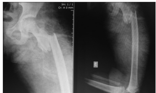
Figure 4: A 11-year-old female, car accident