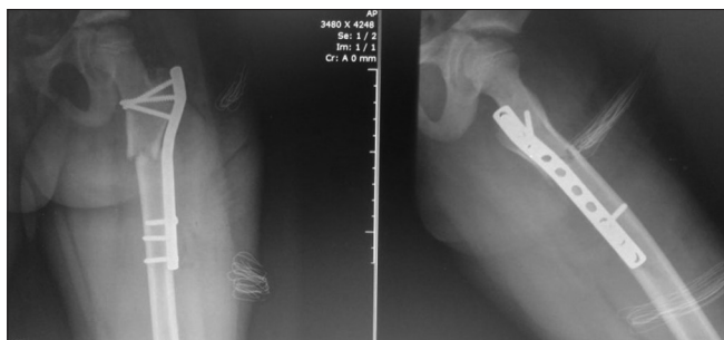
Figure 5: Proximal molded submuscular plate postoperative

deformity ( 15^\circ , 10^\circ , and 14^\circ ), and stress shielding at the distal end of the plate, as well as screw tip prominence in the medial thigh due to bone remodeling. All three patients had the plates removed, and one of the patients required two osteotomies to correct the femoral deformity.