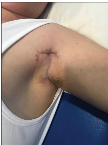
Figure 1: Incision used for pectoralis major release

CMCJ: Carpometacarpal joint, FCU: Flexor carpi ulnaris, FCR: Flexor carpi radialis, ECRB: Extensor carpi radialis brevis, ECRL: Extensor carpi radialis longus, PT: Pronator teres, FDS: Flexor Digitorum Superficialis, FPL: Flexor pollicis longus, FDP: Flexor digitorum profundus, MCPJ: Metacarpophalangeal joints, ECU: Extensor carpi ulnaris, EPL: Extensor pollicis longus, BR: Brachioradialis, APL: Abductor pollicis longus, CVA: Cerebrovascular accident, HO: Heterotopic ossification, A/A: Patient number