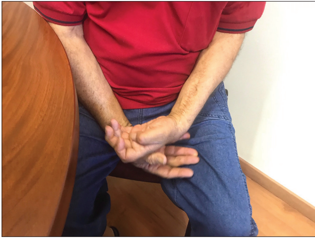
Figure 6: Secondary extension deformity of MCPJs post-brachioradialis to extensor digitorum communis transfer. This prevents the patient to wrap his hand around an object and achieve a stable grip

and evident function of the brachioradialis. However, we would recommend it for augmentation of wrist extension by transferring it either to the ECRL or the ECRB. We did transfer it to the ECRL of a patient with very weak wrist extensors (we also transferred the ECU to the ECRB), and the patient went on to achieve a very good extension of the wrist [Video 8].