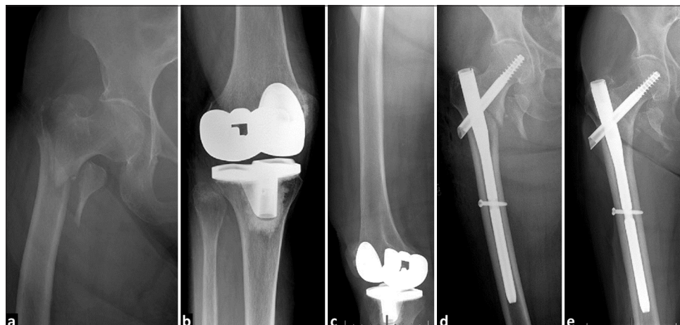
Figure 3: (a) Plain hip radiograph of a 90-year-old female presented with AO/OTA 31A2.3 trochanteric fracture. (b and c) The patient also had a loose, malrotated total knee arthroplasty (TKA). (d) Immediate post-operative hip radiograph and (e) 8-week post-operative plain hip radiograph showing fracture healing after insertion of intermediate-length cephalomedullary nails (ILCMN). The surgeon opted for intermediate-length cephalomedullary nails rather than long cephalomedullary nails to avoid any potential interference with the TKA, which would potentially require revision.