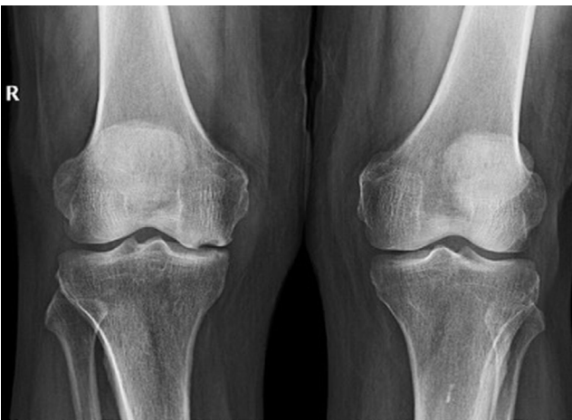
Figure 3: A standing anteroposterior radiograph showing a radiolucent lesion of the medial femoral condyle with a significant bony depression (crescent sign).

The patient underwent arthroscopic partial medial meniscectomy at another institution in Europe. He returned to our clinic 6 months later due to worsening pain over the previous 3 months. He now reported the pain in the medial knee compartment as sharp and of greater severity than preoperatively, which significantly limited his activities of daily living and required a gait aid. On examination, there was no sign of surgical wound infection. Radiographs revealed a radiolucent cortical bone depression with a rim of bony sclerosis on the medial femoral condyle [Figure 3]. A repeat MRI (6 months after surgery) confirmed the presence of bone marrow edema, associated with irregularity of the articular surface, and an area of depression on the medial femoral condyle [Figure 4]. Conservative treatment, including NSAIDs and a course of non-weight-bearing, was attempted initially. Without improvement after