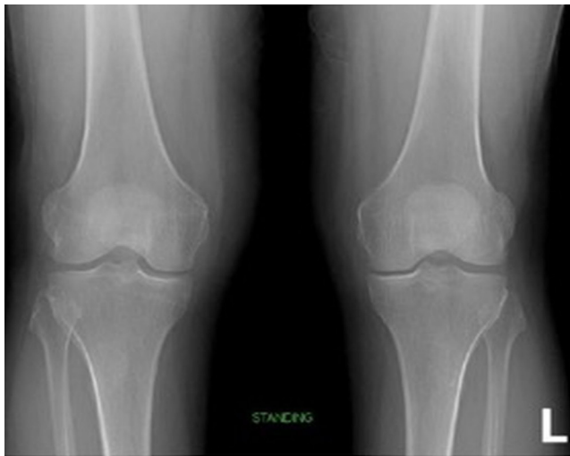
Figure 1: Preoperative standing radiograph showing mild arthritic changes of the knee joint.

On examination, the patient was obese, with a body mass index of 31 kg/m 2 . He had a normal gait pattern, with a full range of motion of the knee joint bilaterally, and no lower extremity muscle weakness. There were no signs of right knee effusion or indication of infection, and ligament stress tests were negative. A mild genu varus alignment was observed bilaterally. On palpation, there was significant tenderness along the medial aspect of the right knee. Radiographs revealed early mild arthritic changes, with mild bilateral narrowing of the medial joint space [Figure 1]. Magnetic resonance imaging (MRI), performed 6 months after symptom onset, revealed a degenerative tear of the medial meniscus, with intact cartilage and no sign of osteonecrosis [Figure 2]. Conservative management was recommended, including weight loss, activity modifications, continued use of NSAIDs, and physical therapy.