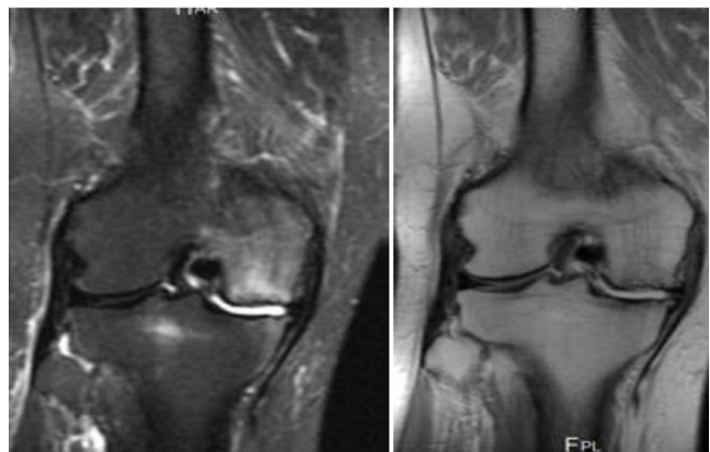
Figure 4: (a) Coronal T2- and (b) T1-weighted magnetic resonance images showing a focal subchondral patch of decreased bone marrow signal on the T1-weighted image and a high signal on the T2-weighted image of the medial femoral condyle, which indicate bone marrow edema. Irregularity of the articular surface, with a subtle depression of the articular surface and signal alteration, was observed.