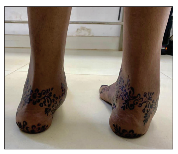
Figure 2: Posterior view of the deformity.

Two surgical interventions were performed at 6 months intervals. After a discussion with the patient, the first surgery was performed on the left foot. The symptoms of the left foot were more severe and demanded intervention. The left foot was corrected first (as it was more problematic), followed by the right 6 months later. A medial sliding calcaneal osteotomy, gastrocnemius recession, and a cotton osteotomy (medial cuneiform open wedge osteotomy) were performed on the left foot. The left foot was in a walker boot for 2 months, and a structured physiotherapy program was carried out. In comparison, we performed lateral sliding calcaneal osteotomy, plantar fasciotomy, and peroneus longus