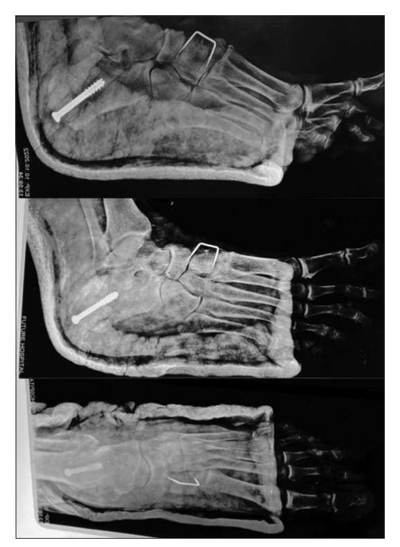
Figure 5: Radiograph showing post-operative anterioposterior and the oblique and lateral views of the left foot.