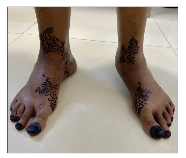
Figure 1: Anterior view of the deformity.