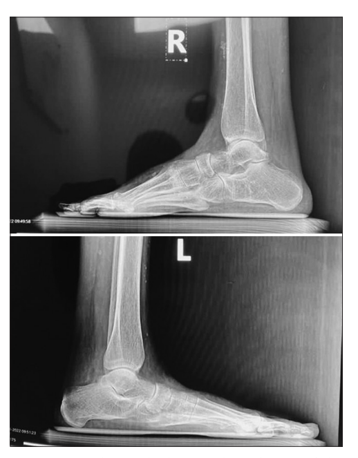
Figure 4: Radiograph showing lateral view of the deformity.

In this case, the patient had symptomatic pes-planus of the left foot, stage two and cavo-varus deformity of the right foot. Both deformities can result in a significant effect on foot function. However, the combination of the two causes more functional impairment. Surgical correction was performed in the form of medial sliding calcaneal osteotomy and cotton osteotomy. These two procedures help to correct the heel valgus and to restore the medial arch of the foot, respectively. Hirose and Johnson studied 16 feet (15 patients) with plantarflexion opening wedge medial cuneiform osteotomies to correct the forefoot varus part of flatfoot deformities.<sup>[15]</sup> They concluded that opening wedge medial cuneiform osteotomy is a crucial adjunctive procedure for correcting the forefoot varus in flatfoot deformities.