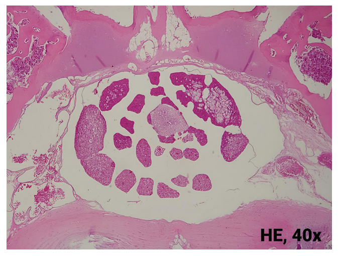
Figure 1: Axial view of normal lumbar vertebrae. HE: Hematoxylin and eosin.

This study demonstrated that rats receiving autologous fat pads in the laminectomy defect area showed histological