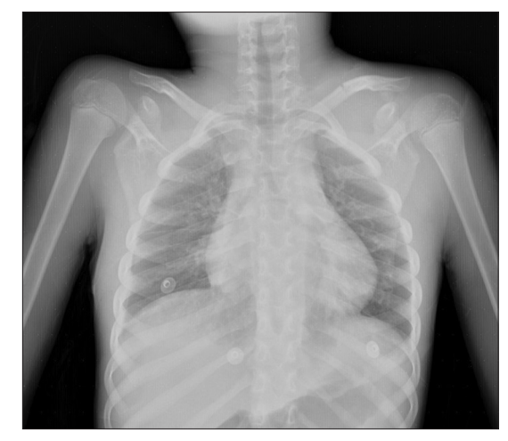
Figure 4: Postoperative radiograph

The patient with posterior SCJ dislocation will frequently complain of pain and swelling that sometimes can be intense and disproportionate to clinical findings. Their signs may be subtle, so a careful and distinctive doubt is required for diagnosing posterior SCJ dislocation. Therefore, in the setting of significant trauma, it can be commonly missed.[3,10,12] Besides these symptoms, others can also be associated with posterior SCJ displacement like shortness of breath if the trachea was compressed or if the patient developed pneumothorax. Furthermore, choking, difficult or painful swallowing if the esophagus got compressed. Voice changes if the nerves were pressed.<sup>[1-3,5-8,10-12]</sup> Life-threatening accidents may be connected to posterior displacement of the SCJ due to the closeness of critical upper mediastinal organs. Posterior SCJ disruptions have joined intrathoracic or superior mediastinal insults in up to 30% of incidents. Posterior displacement must be rolled out due to the high mortality linked to this type of injury, which accounts for 12.5% of all SCJ dislocations. This scary associated incident involves compression or tear of large vessels, lungs pleura, trachea, esophagus, and injury to the brachial plexus.<sup>[1,3,6,7,9-12]</sup> Accurate history, clinical examination, and plain radiographs do not dispense the need for urgent CT scan or angiographic CT scan whenever there is a suspicion of dislocation.<sup>[5,12,14]</sup>