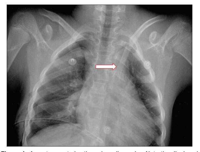
Figure 1: An anteroposterior thoracic radiographs. Note the displaced medial end of clavicle (arrows) on the left side

He was instructed to start physiotherapy sessions on the 6^{th} week as a passive shoulder range of motion to reach an abduction of 60^{\circ} and forward flexion of 90^{\circ} . On the 6-week and 3-month postoperative follow-up visits, he displayed clinical healing of the surgical wound and an acceptable range of motion.