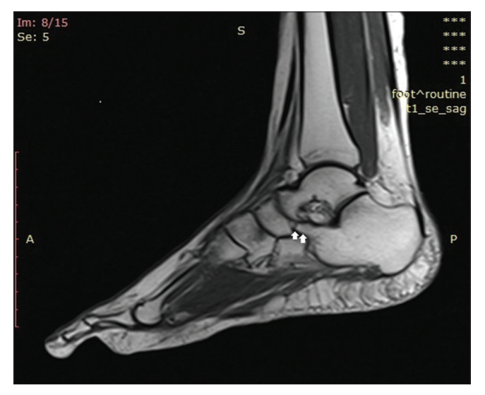
Figure 2: A sagittal T1-weighted magnetic resonance image of a 22-year-old female complaining of the right heel pain demonstrates the osteocartilaginous type of calcaneonavicular coalition where an elongated anterior process of the calcaneus (arrowheads) approaches the navicular, sometimes referred to as the "anteater's nose sign."

images (radiographs/CT scan/MRI), the tubular elongation of the anterior calcaneal process that approaches or overlaps the navicular bone in case of the calcaneonavicular coalition is referred to as the anteater nose sign, resembling an anteater's nose. [1] Similarly, the reverse anteater sign [2] refers to the posterior and lateral extension of the navicular bone, also seen in the case of the calcaneonavicular coalition. However, a similar appearance may be seen on sagittal section images in the case of a talocalcaneal coalition, as seen on MRI in our case.