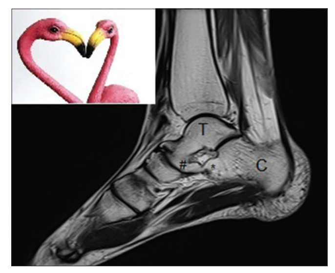
Figure 3: T1-weighted sagittal magnetic resonance image depicting the talocalcaneal coalition involving the middle facet of the subtalar joint giving the "opposing beaks" sign as the two projections, one each from the middle facet of the subtalar joint (on the calcaneus, denoted by *) and from the inferiomedial aspect of the dome of the talus (denoted by #) appear like the beak of two birds opposing and approaching (and merging with) each other. (Inset: The image of two birds with their beaks opposing each other).

images (radiographs/CT scan/MRI), the tubular elongation of the anterior calcaneal process that approaches or overlaps the navicular bone in case of the calcaneonavicular coalition is referred to as the anteater nose sign, resembling an anteater's nose. [1] Similarly, the reverse anteater sign [2] refers to the posterior and lateral extension of the navicular bone, also seen in the case of the calcaneonavicular coalition. However, a similar appearance may be seen on sagittal section images in the case of a talocalcaneal coalition, as seen on MRI in our case.