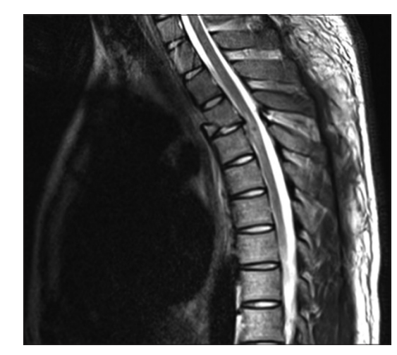
Figure 2: T2-weighted MRI sagittal section of the thoracic spine showing D3 teardrop fracture with impingement of the adjacent spinal cord by the posterior fragment.