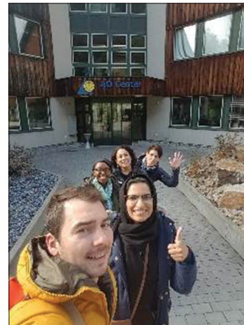
Figure 2: During visit to the AOCID office in Davos, Switzerland, Headquarter of AO Foundation