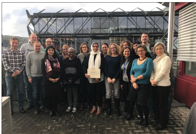
Figure 3: Last day at Dubendorf office of AOCID with colleagues