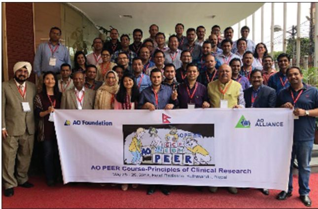
Figure 5: Organized the First AO Program for Education and Excellence in Research Course Basic Principles of Clinical Research in July 2018 in Lahore, Pakistan

alignment with ISO 14155, ICH-GCP, and other applicable regulations. An increasing number of outside vendors have audited and appointed AOCID as a “Preferred 3 rd Party Provider” in recognition of the expertise housed within.