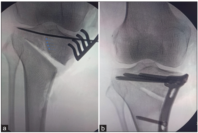
Figure 2: (a) Intra-articular fracture (blue arrows) during gap opening where displacement was prevented by the subchondral Kirschner wires. (b) Definite fixation of intra-articular fracture during high tibial osteotomy using the TomoFix plate.

was achieved. Full weightbearing was permitted after eight weeks with no subsequent complications.