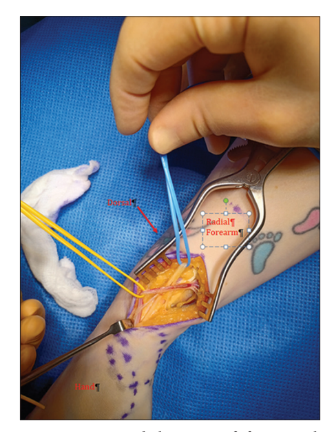
Figure 1: Incision over radial aspect of forearm showing the anomalous radial artery traversing the branches of the superficial radial nerve.

Variations in the course of the radial artery have mainly been observed in the origin and proximal course rather than the distal course or terminal branches.<sup>[5]</sup> One anatomical study looking at 100 upper limb cadavers found no variation in the course of the radial artery. Furthermore, the radial artery was not closely related to other neurovascular structures in the forearm.<sup>[6]</sup>