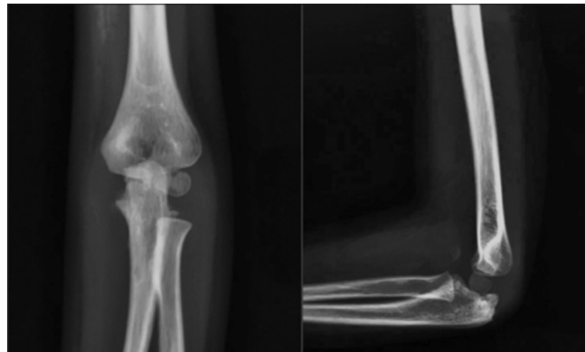
Figure 4: Four weeks follow-up anterior–posterior and lateral X-rays with excellent consolidation and good articular congruency