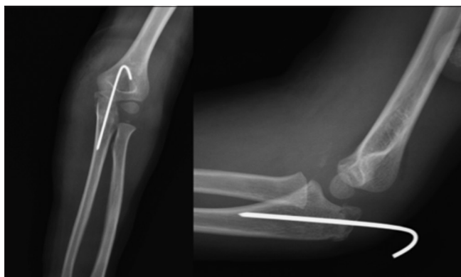
Figure 3: Fixations with one percutaneous Kirschner wire 1.6 mm entering the tip of the olecranon and anchored to the anterior cortex of the ulna