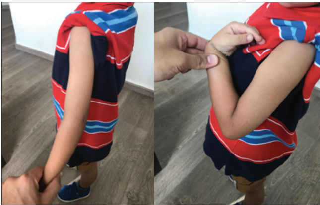
Figure 5: Five-week clinical images, demonstrating almost full extension and 120° of flexion