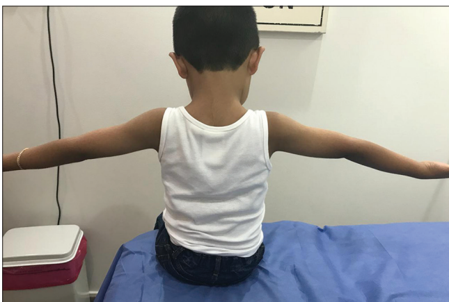
Figure 7: Six-month follow-up demonstrating full extension and 120° of flexion

consolidation and articular congruency. One advantage of our approach is that since closed reduction and fixation were done, the fracture hematoma and soft tissues were respected, which may also have contributed to the good outcome.