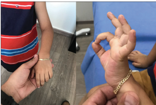
Figure 6: Five-week clinical image, showing full pronation and no neurovascular impairment